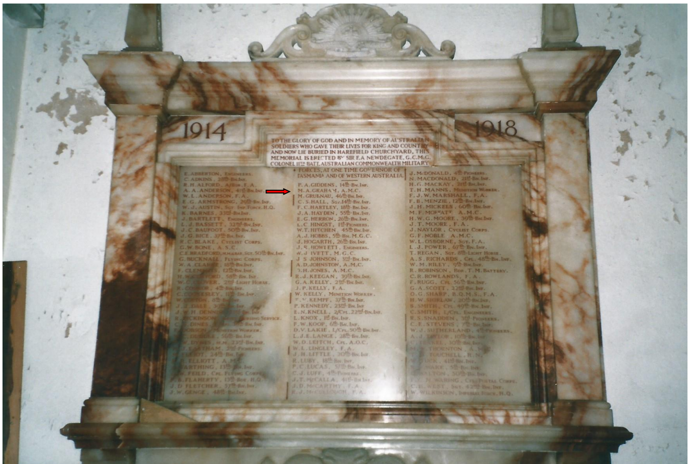
Australian Soldiers' Memorial, Harefield