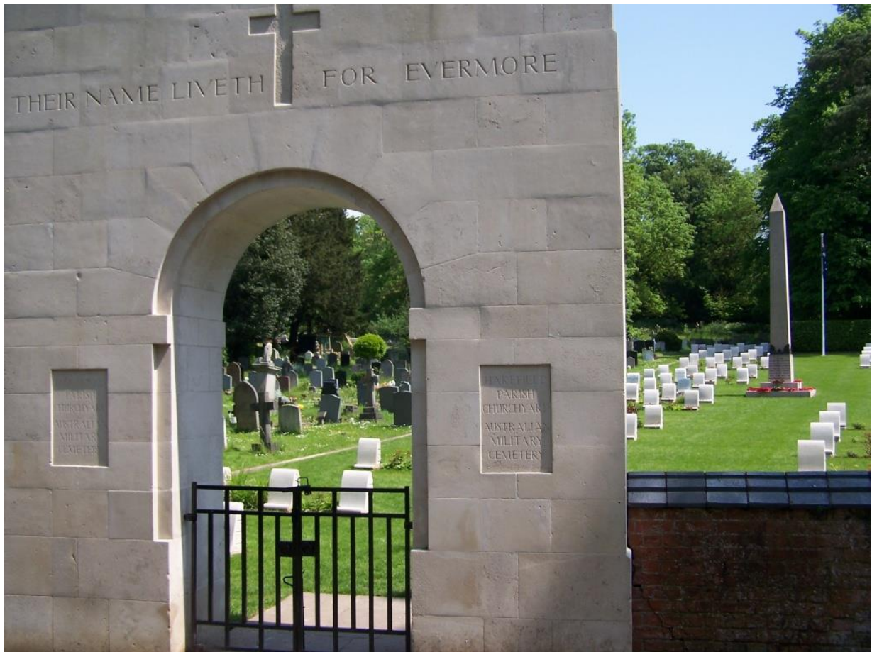
St. Mary the Virgin Churchyard