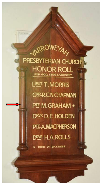
Yarroweyah Presbyterian Church Honor Roll