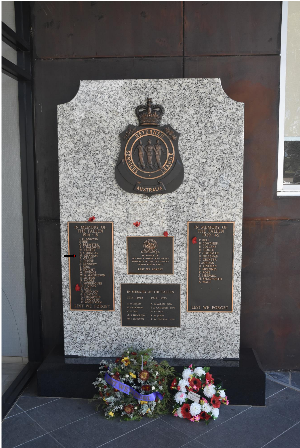
Cobram Honour Roll