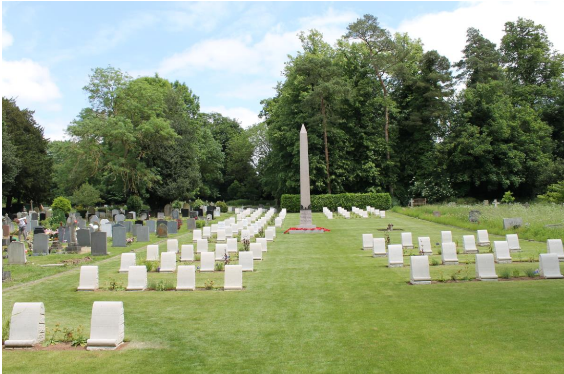
St. Mary the Virgin Churchyard, Harefield