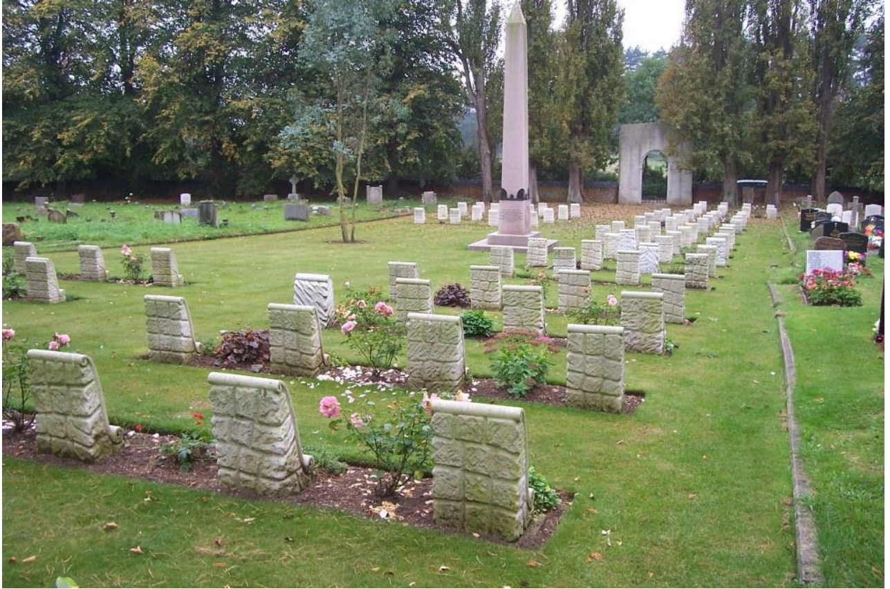
St. Mary the Virgin Churchyard