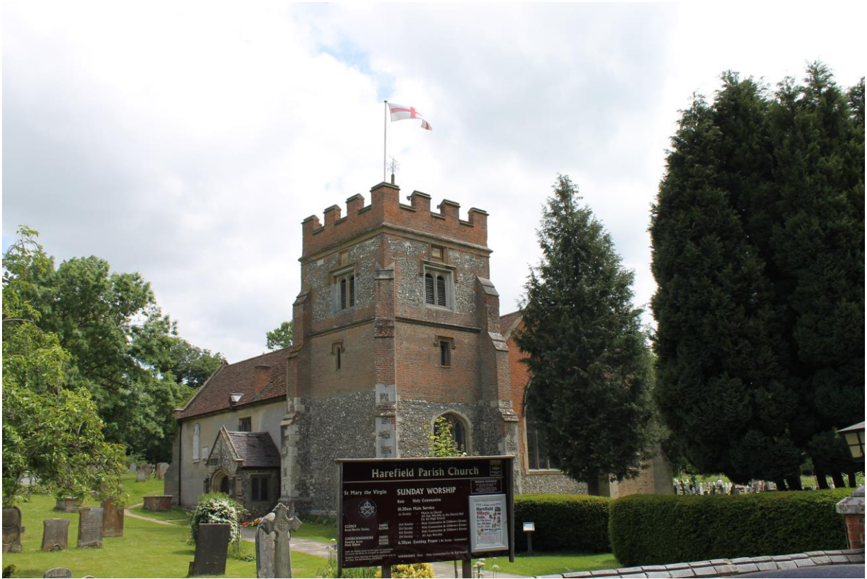
St Mary the Virgin Church, Harefield